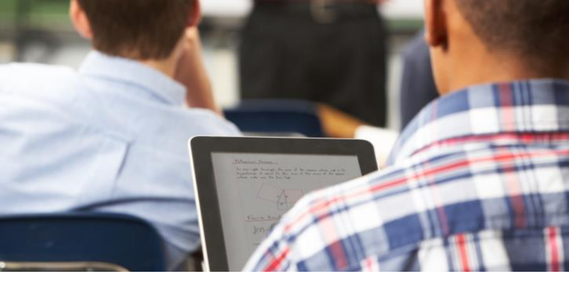
College-readiness determined by placement tests or ACT.