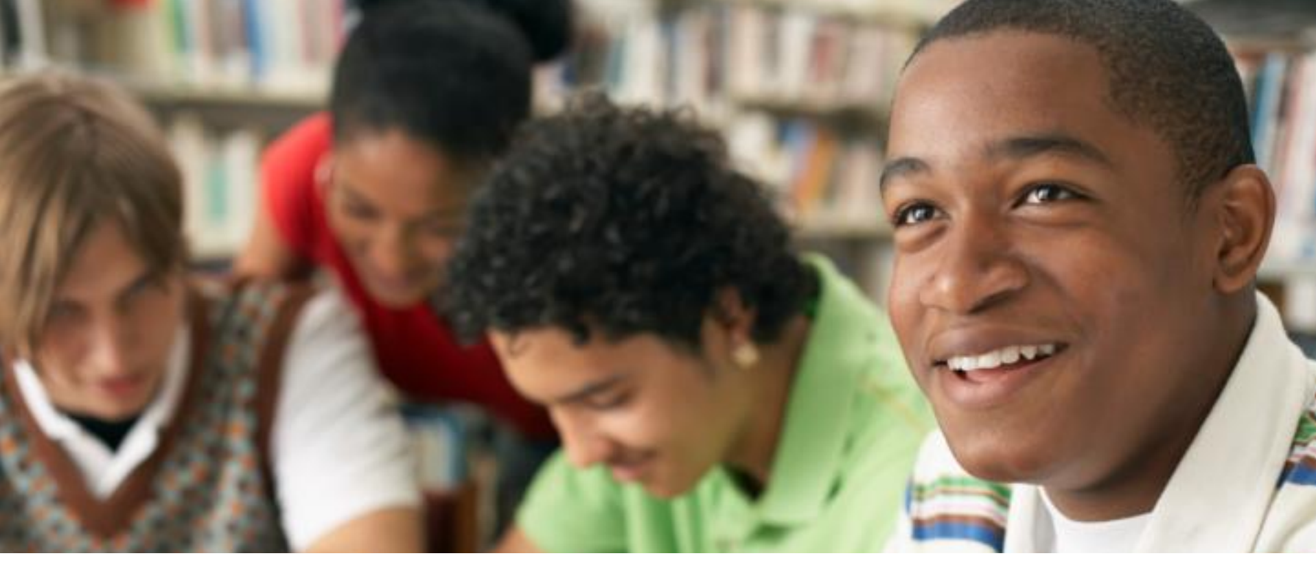
What is College Credit Plus?